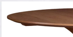
1" Top Edge Detail