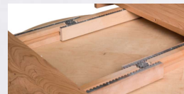
Gear Slide System