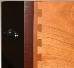
Dovetail Drawer Boxes