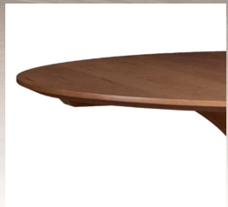
1" Solid Tops