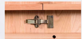
Table Lock Detail