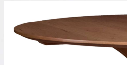
1" Top Edge Detail