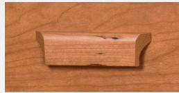
Wooden Pull Detail