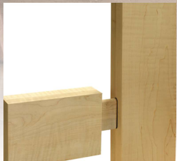
Mortise & Tenon