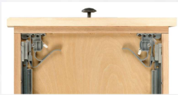
Undermount Soft-Close Drawer Slide