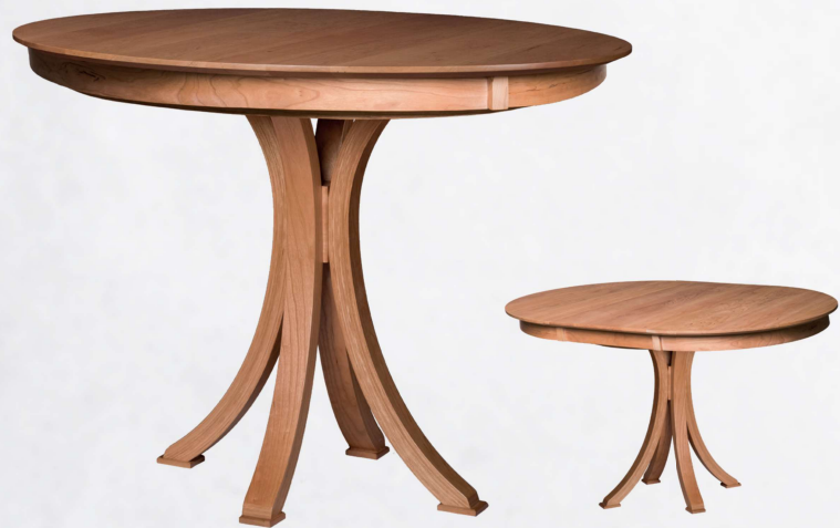
Shown with one leaf